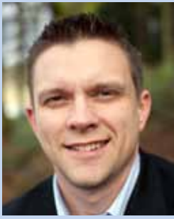
Executive Manager/ Chief of Security

Maintaining a safe and secure campus is a high priority at Corban. The University employs a full-time certified Executive Manager/Chief of Security, and all security agents are trained and licensed by the State Department of Public Safety Standards and Training.