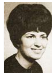
Yearbook photo, 1967

churches. She later worked as Campground Chaplain's wife at 1000 Trails Campground in Pacific City, Oregon.